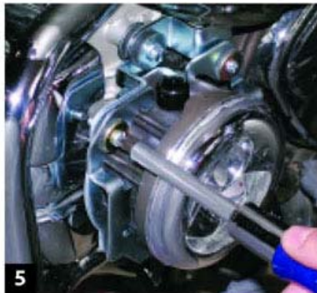
5 Fit the lamp bracket onto the mounting bracket and attach it with the short flange and longer Phillips head screws.