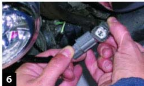
6 Unplug the plug cap from the two-pin gray connector on the bike, and plug in the fog lamp.