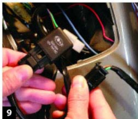
9 Plug the four-pin switch connector into the relay harness, and plug the relay harness into the motorcycle accessory four-pin connector. The kit also comes with a jumper plug which can be used in place of the relay which makes the lights function only with the switch.