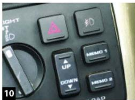
10 After testing the lights, reinstall the control panel. The new switch looks stock, and is illuminated whether the fog lights are on or off.