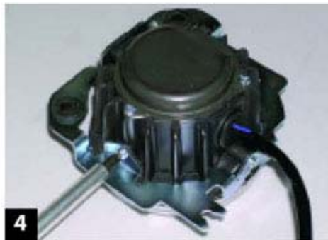
4 Install the fog lamp to the right bracket with three small Phillips head screws.