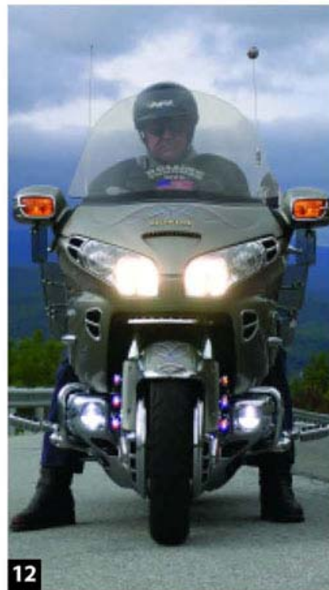
12 Once you've got the aim adjusted, reinstall the cowl and go for a ride. RB