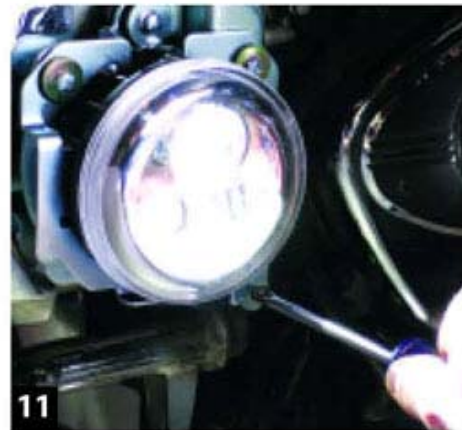
11 If the LEDs are aimed too high, you'll blind oncoming vehicles. With the bike on level ground, aimed at a wall about 16' away, measure the distance from the ground to the center of one of the fog lamps. Make a mark on the wall to that measurement. Tighten the adjuster screws on each fog lamp until they lower to that level.