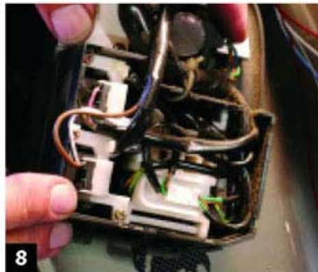
8 Moving to the left side fairing, remove the trim, control panel, and switch cover located on the back of the control panel. Remove the switch hole cover and install the new switch in it's place.